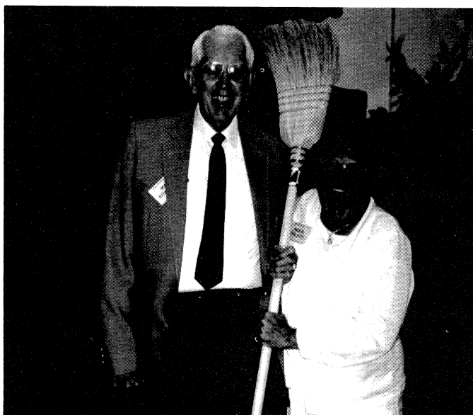
A Clean Sweep?