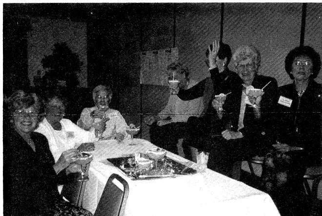
The Margarita Girls